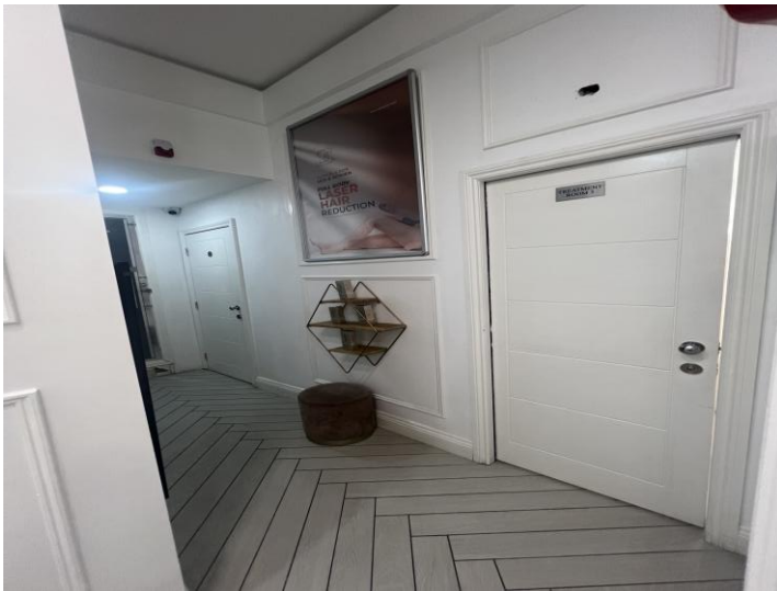
Toilet next to Treatment Room 3