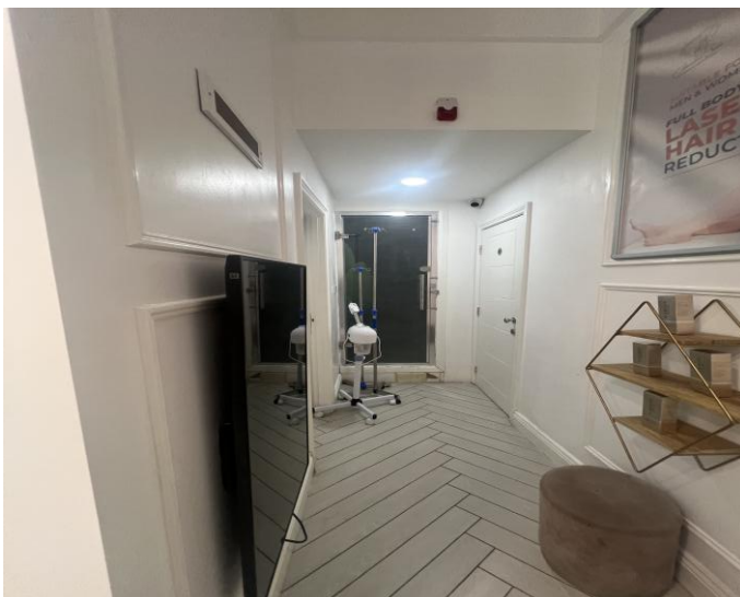
Treatment Room 4 facing Toilet