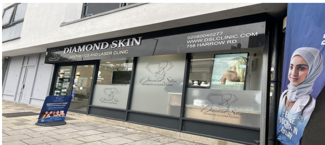
Front of premises