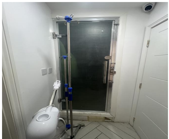
Rear 'Fire Exit'