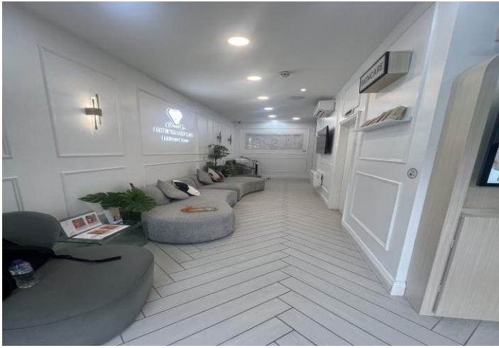
Seating Area (view from entrance)